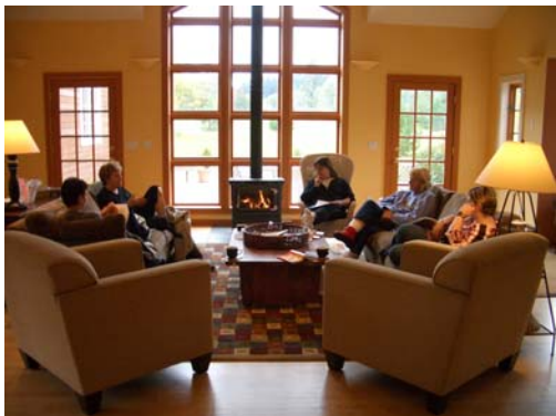
Part of the group at a previous cleanse

A cleanse is not a fast. Our protocol is to avoid solid foods and gain nutrients by consuming a daily liquid diet including hearty pureed soups for dinner. Following a well designed program, participants drink fluids hourly such as teas, lemonade and fresh juices, along with nutritional supplements. Upon arrival, each person receives instructions & all supplies needed during the cleanse. For those who request more nourishment, a hypoallergenic rice protein drink is available at all times. At previous retreats participants have expressed amazement at how little they think about food & how small their "real" appetite is. Everything used is organic. Pilates, hot tub, & massage can keep you as busy as you want to be.